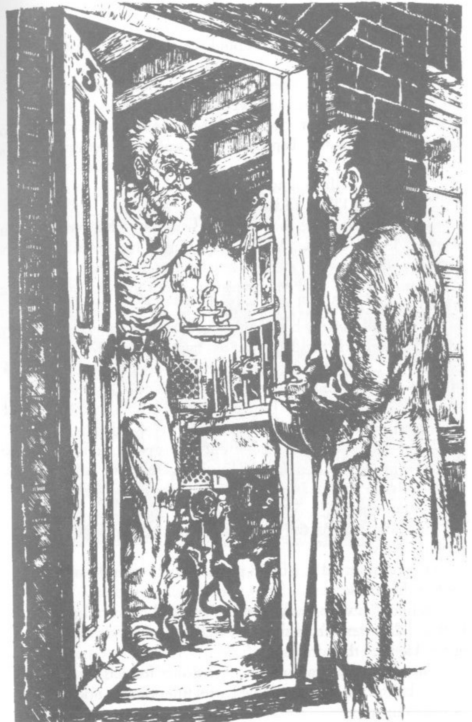
I saw an old man with grey hair and a beard, holding a candle in his hand.

I went into the small dirty house and stopped in astonishment. There were cages everywhere I looked. All the cages contained