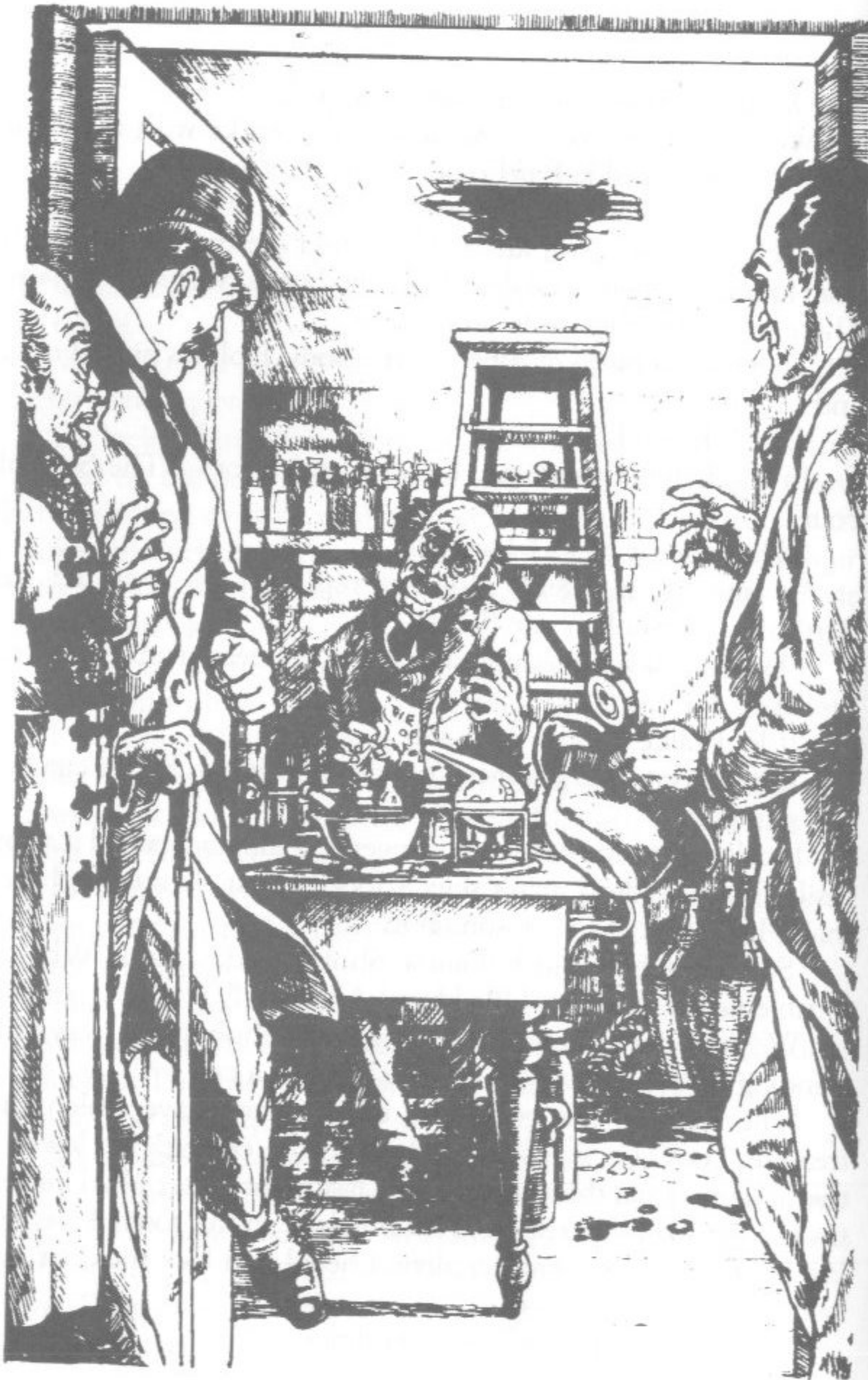
The dead man's body was twisted with pain.

'Yes,' said Holmes. 'But the wooden-legged man was not alone. Someone else has been here too. Look outside.' We both went to the window and looked down. 'We are very high up,' said Holmes. 'A man with a wooden leg would not be able to